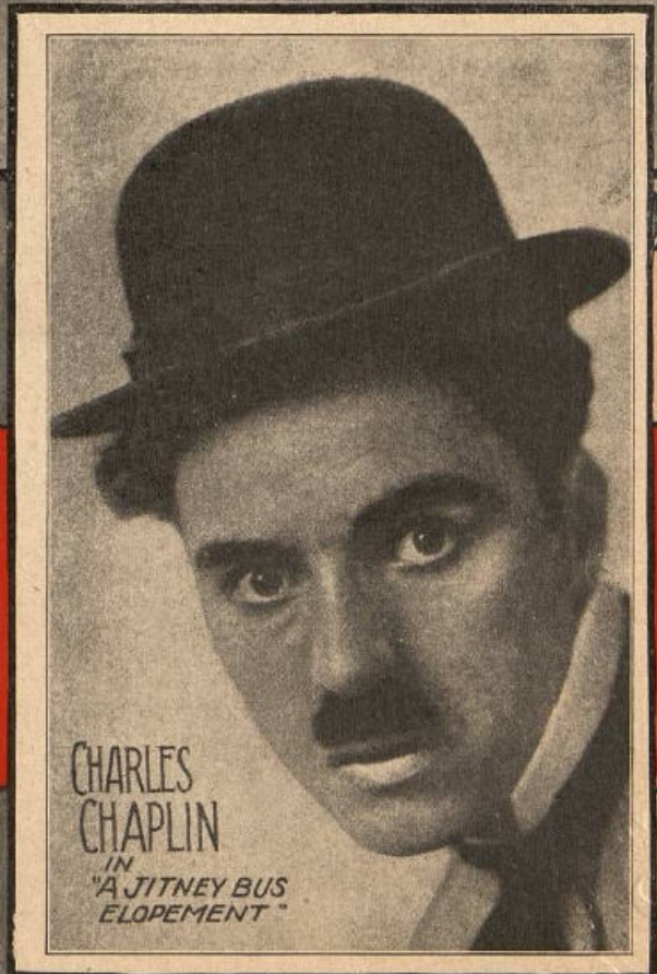
CHARLES CHAPLIN IN "A JITNEY BUS ELOPEMENT"