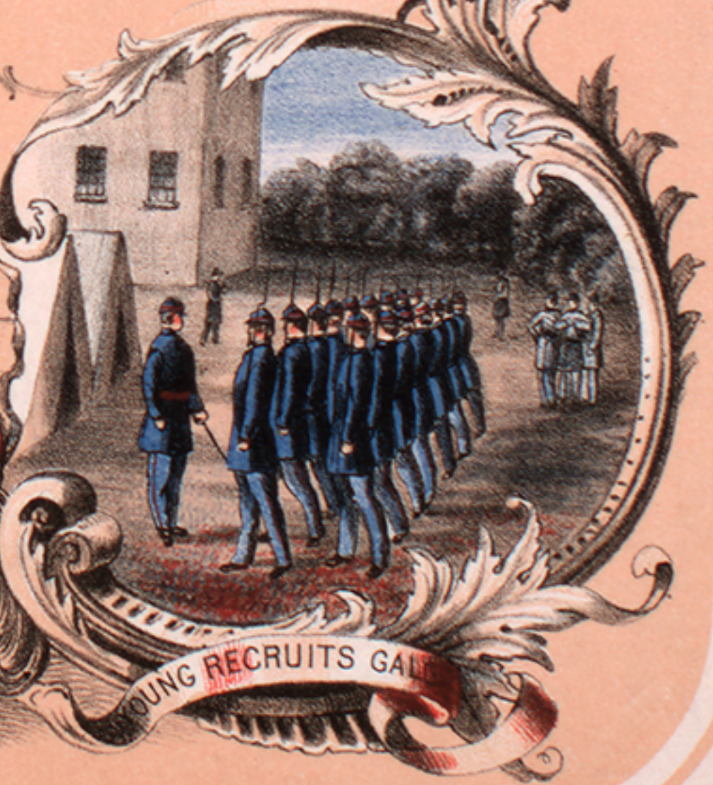
YOUNG RECRUITS GAI