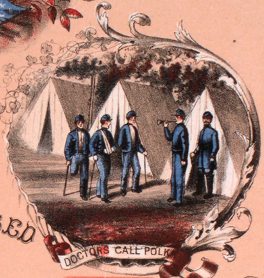
DOCTORS CALL POLK