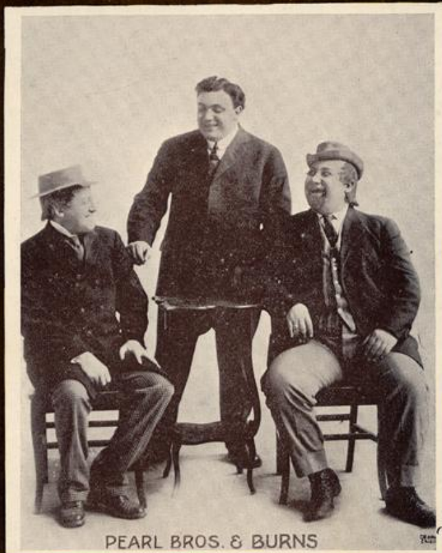
PEARL BROS. & BURNS