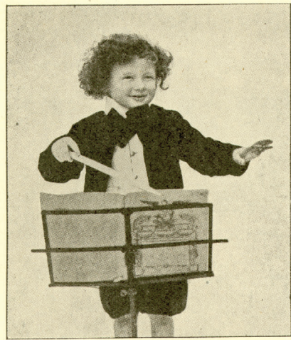
"Vas you ready? Den vistle as you blay und let'er go!"