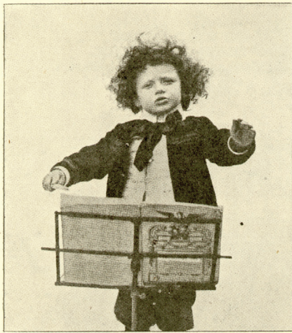
"Schust blay dot trio mit softness und feelin's, please!"