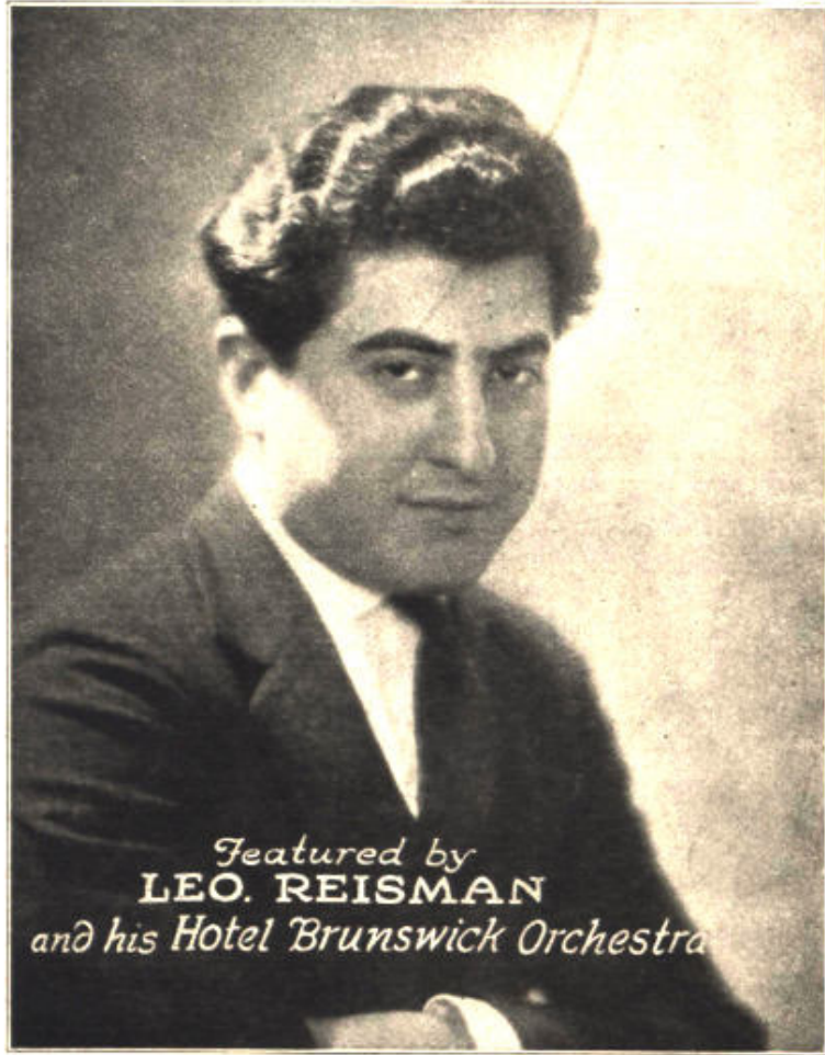
Featured by LEO REISMAN and his Hotel Brunswick Orchestra