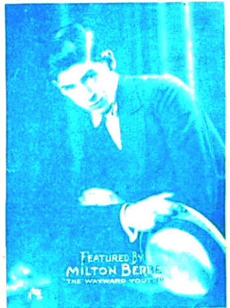
FEATURED BY MILTON BERLE THE WAYWARD YOUTH

HENRY WATERSON INC. 1571 BROADWAY, NEW YORK, N.Y. WATERSON, BERLIN & SNYDER CO. SELLING AGENTS