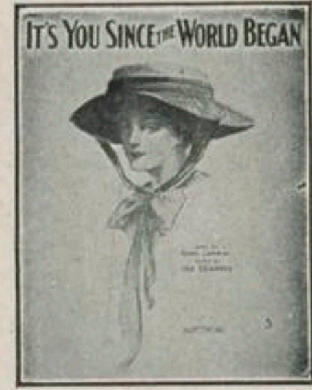
A Charming, Melodious Song