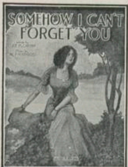
SWEET AND CATCHY MELODY