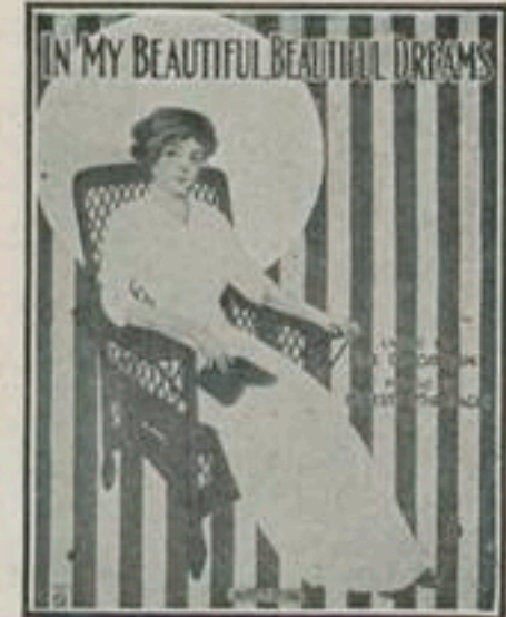
The Most Entrancing Melody You Ever Heard