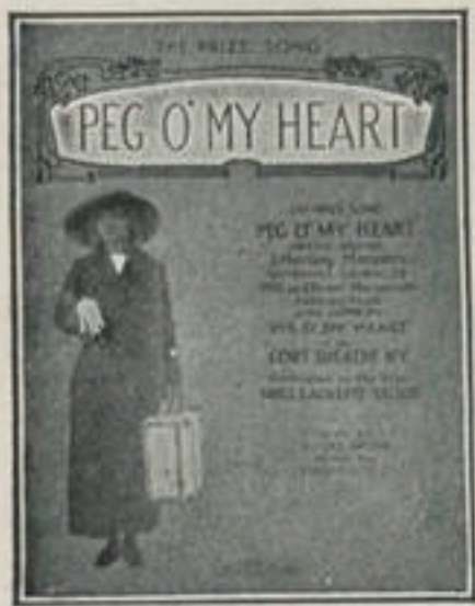
The Hit of "Peg O' My Heart" Show.