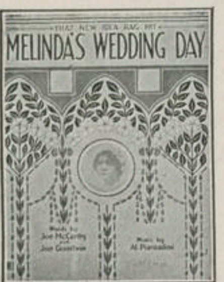
A HIT FROM COAST TO COAST