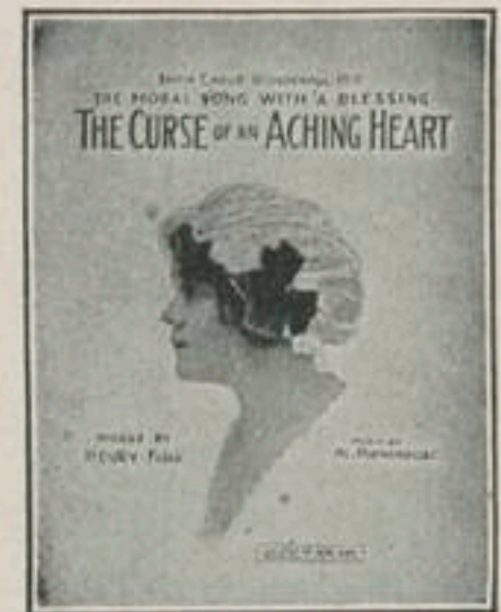
Best Descriptive Ballad Ever Written

Complete Copies on Sale wherever you buy your Music or mailed direct for 15c. each, or the entire 8 numbers for $1.00