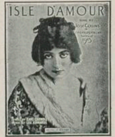
"FOLLIES OF 1913" Semi-Classical