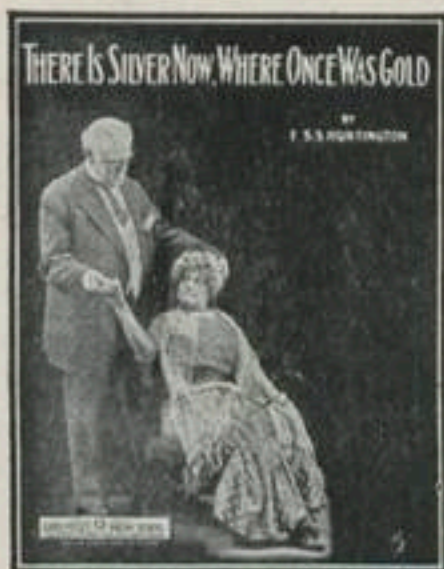
EVERYBODY LOVES IT!