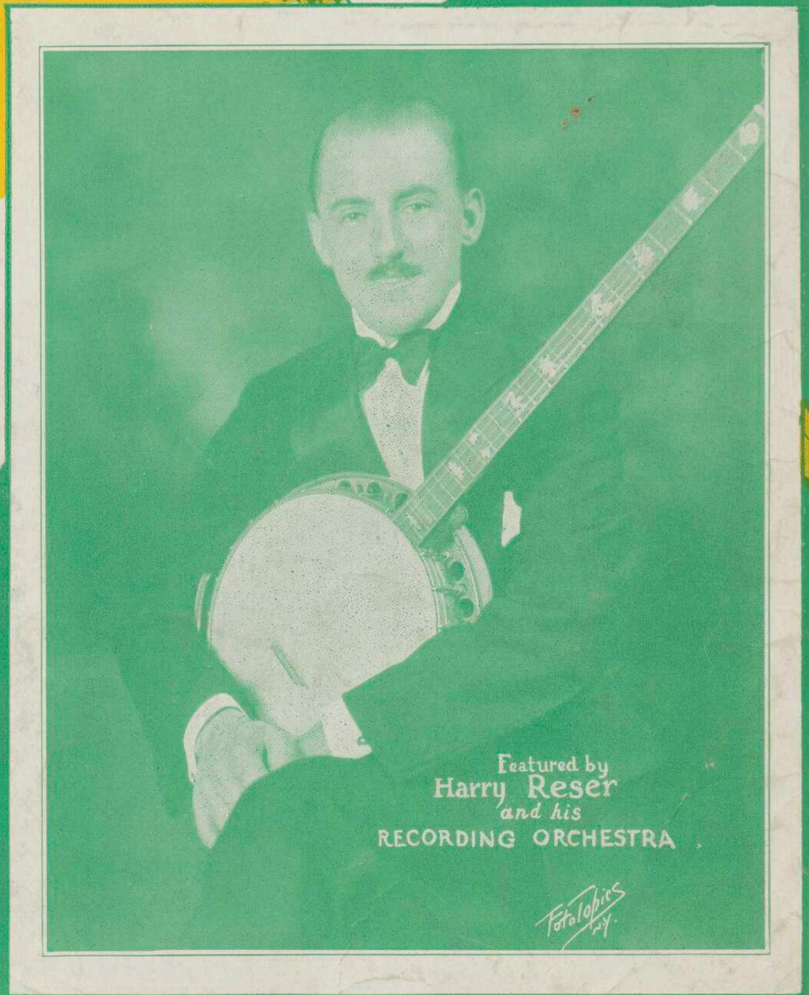
Featured by Harry Reser and his RECORDING ORCHESTRA