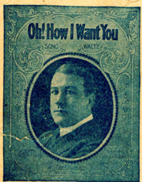
Great Waltz Ballad