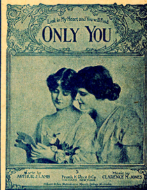
Waltz Song Hit