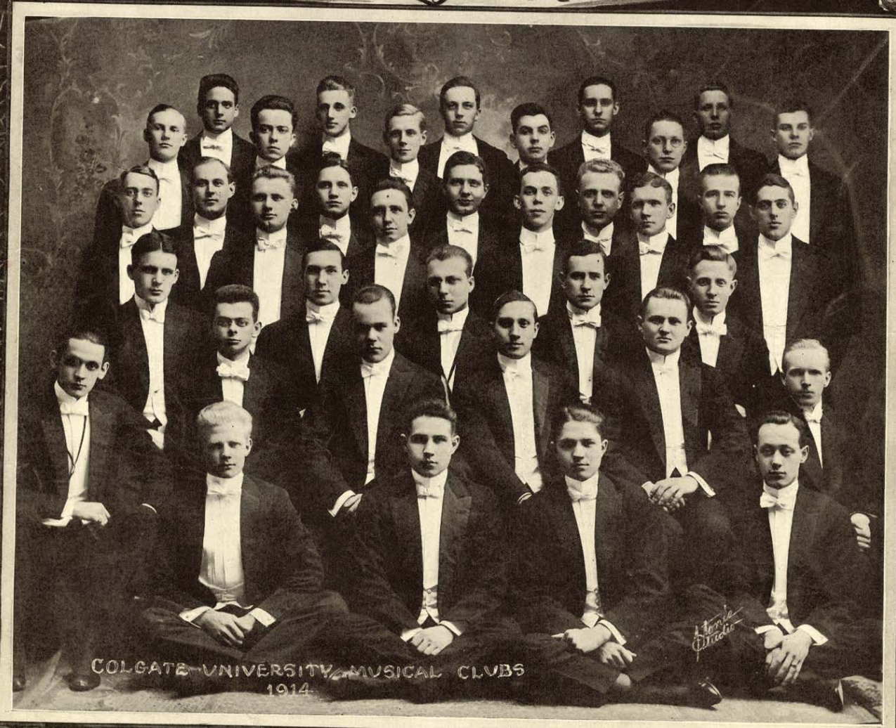
COLGATE UNIVERSITY MUSICAL CLUBS 1914