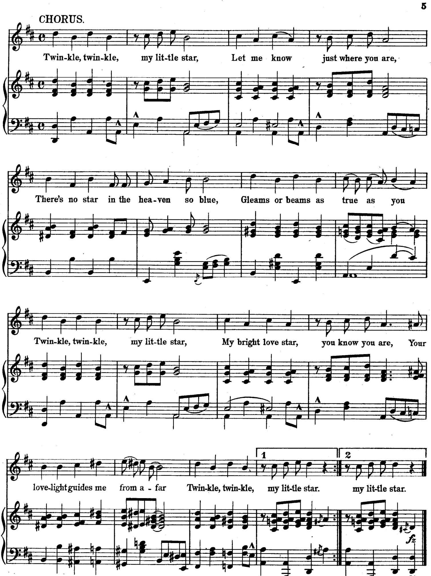
Twinkle, twinkle, my little star. 3