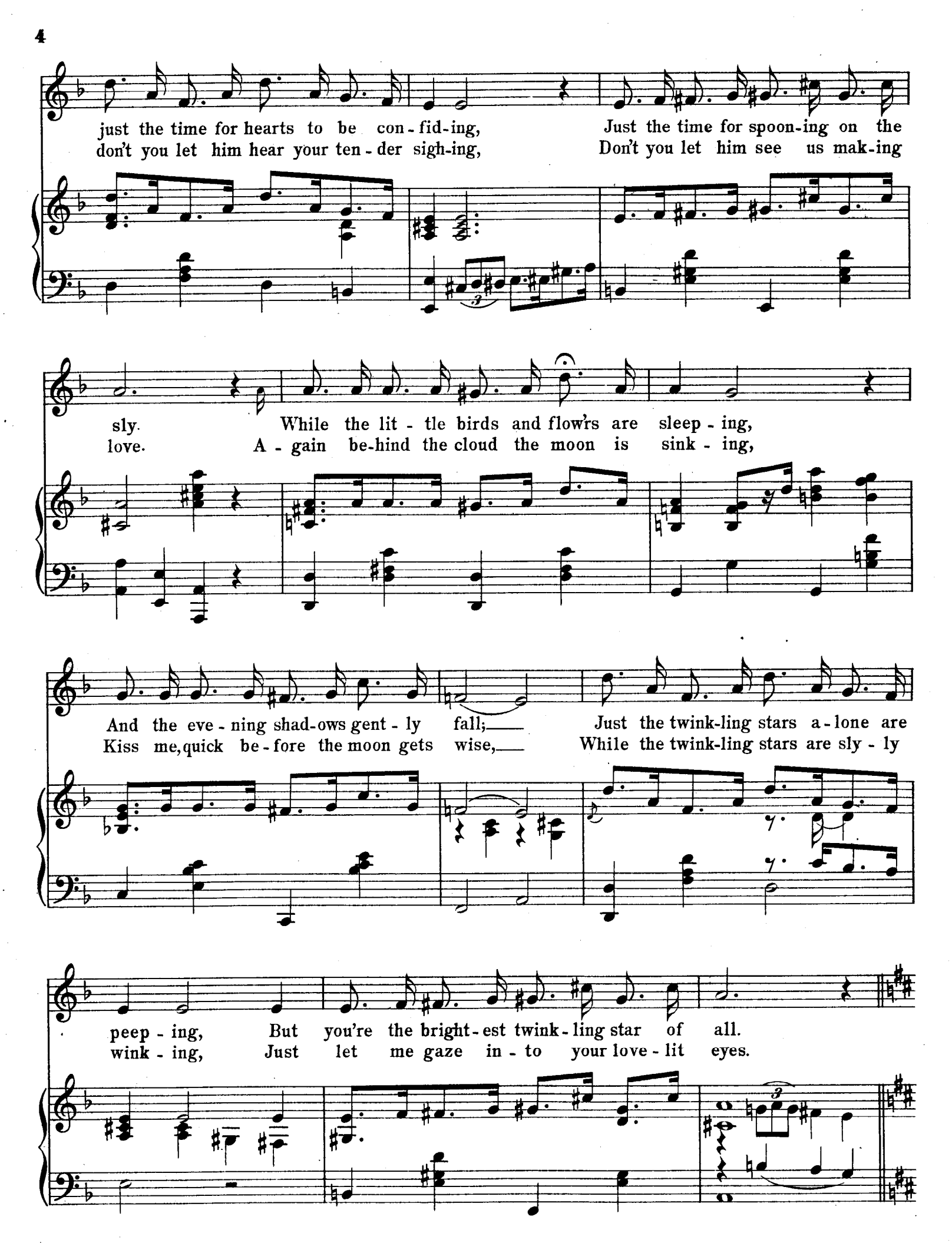
Twinkle, twinkle, my little star. 3