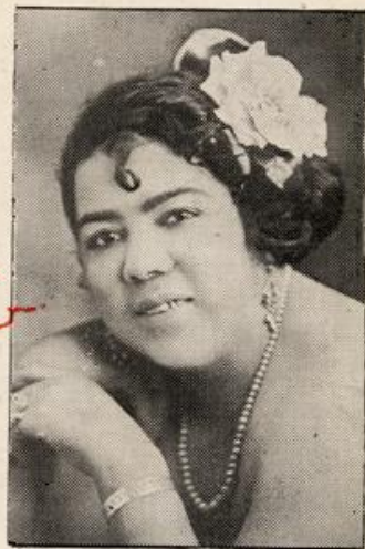
FEATURED BY Lizzie Miles