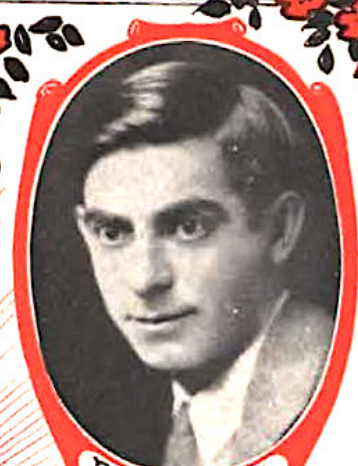
EDDIE CANTOR in "Kid Boots"