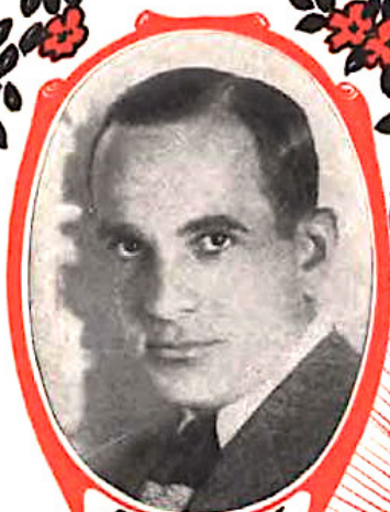
AL JOLSON in "Big Boy."