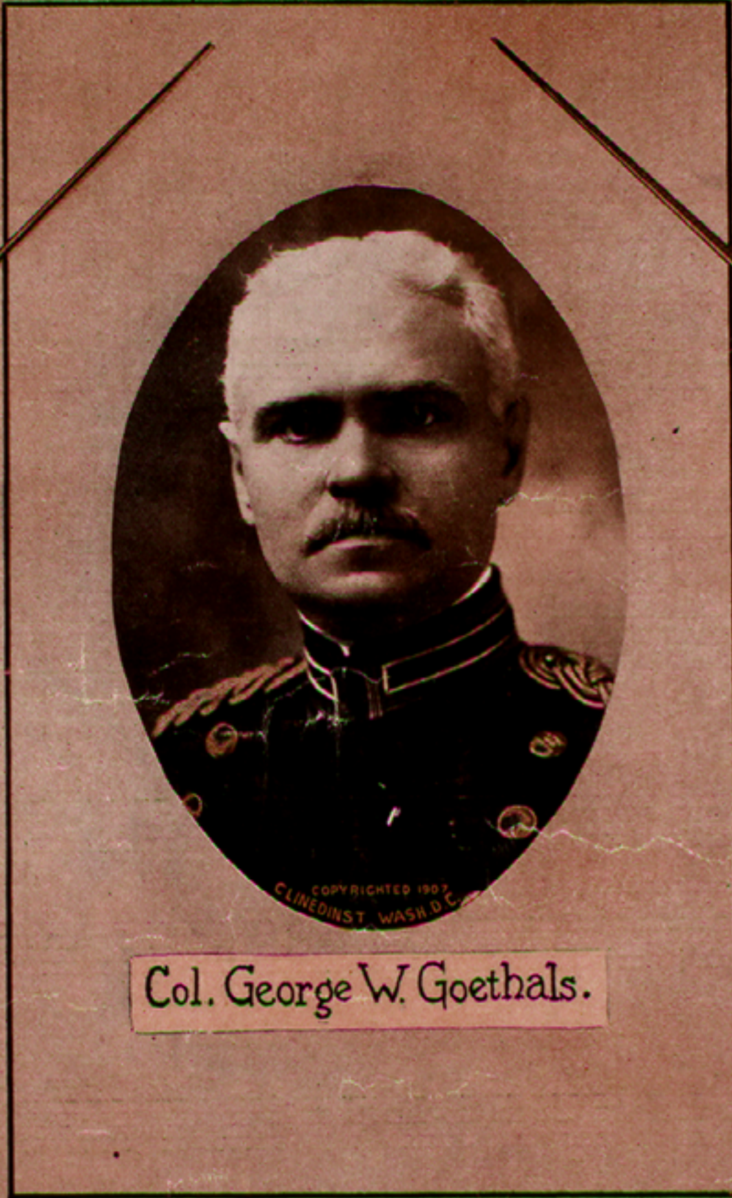
Col. George W. Goethals.